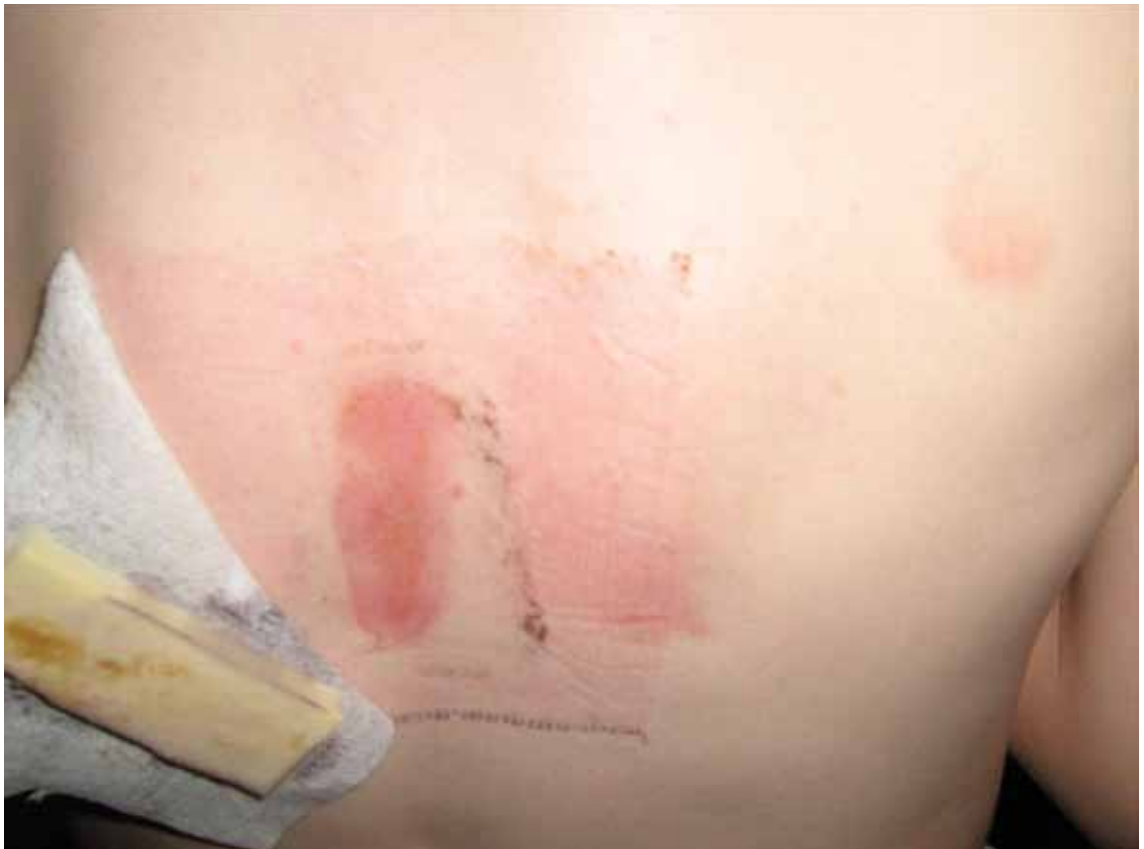
Photograph 2. The resident's injury, one week after he was dragged.