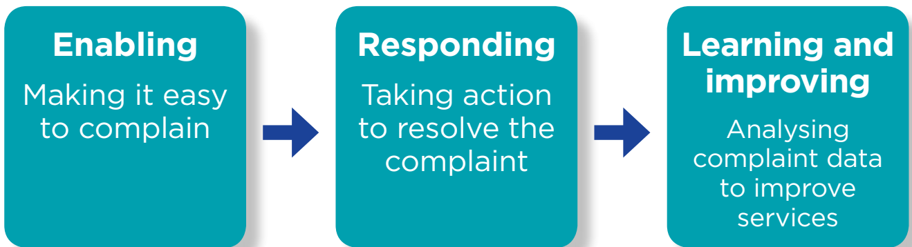
Figure 1: Stages of complaint handling

Each council needs to decide how their complaint handling system will work. This guide can be used to assess how current processes, procedures and mechanisms can be improved, or as an aid to develop new systems.