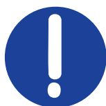
Traps to avoid